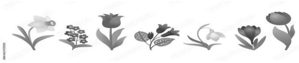
The flowers on the altar in in celebration of March birthdays from Ladies Guild.

The illness and death of Lazarus happened "that the Son of God may be glorified through it" (John 11:4). Jesus' miracle of raising Lazarus prompted His arrest and crucifixion, whereby He would die "for the nation" and gather "into one the children of God who are scattered abroad" (John 11:51-52). As He called Lazarus from the tomb and commanded others to "unbind him, and let him go" (John 11:44), Jesus also calls us and releases us from the bondage of sin and death. We would not "submit to God's law," nor could we "please God" (Rom. 8:7-8), but "he condemned sin" in His own flesh so "that the righteous requirement of the law might be fulfilled in us" (Rom. 8:3-4). Now through the Gospel, "the Spirit of him who raised Jesus from the dead dwells" in us (Rom. 8:11). His Word breathes His Spirit into our mortal flesh, animating us with His own life. As His ministers preach according to His divine command, the Lord Jesus calls us from the grave into the good land that He gives us (Ezek. 37:12, 14).